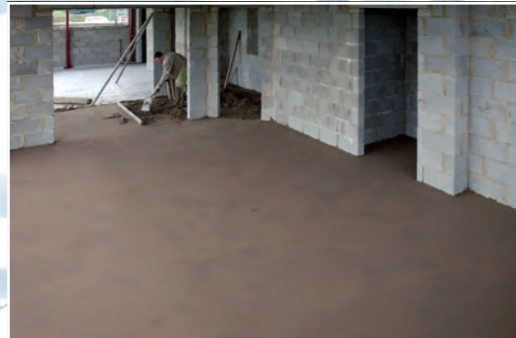
The CEMEX ReadyScreed range offers superb quality and design flexibility for architects and contractors.

CEMEX produces an extensive range of high quality, ready-to-use screed products covering a wide variety of applications including traditional and flowing methods, monolithic, bonded and unbonded construction, and as a floating screed. These screeds are retarded for a specific time and remain usable for up to one working day, which provides significant productivity benefits and enhanced product quality. All of our products are designed with the final surface finish in mind and are tailored to meet individual and specific requirements.