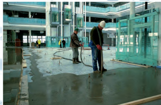
CEMEX Supaflo self-levelling floor screed blends quality with speed of application to deliver exceptional floor finishes in half the time.