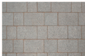
Graphite Grey (GG)