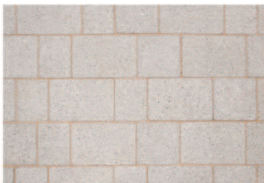
Misty Grey (MG)