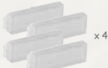
DPS Single Pushbutton