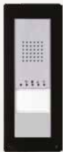
Thangram GSM+ panel