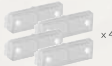
DPD Double Pushbutton