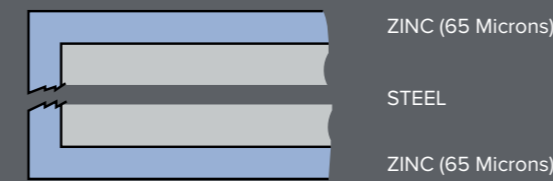
Shown to scale, relative with each other.

HOT DIP GALVANIZING AFTER MANUFACTURE ZINC COATING WEIGHT: 920g/m 2 (inc. both sides)