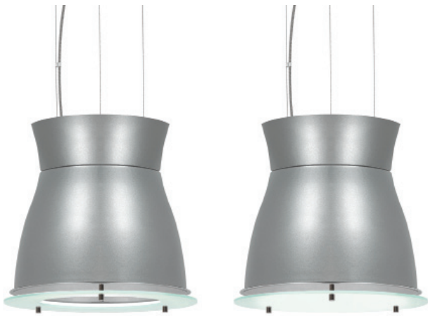
RR Decorative ring