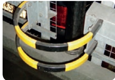
Main image: Lighting Column Protection