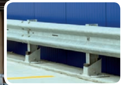
Main image: Spring Steel Buffer