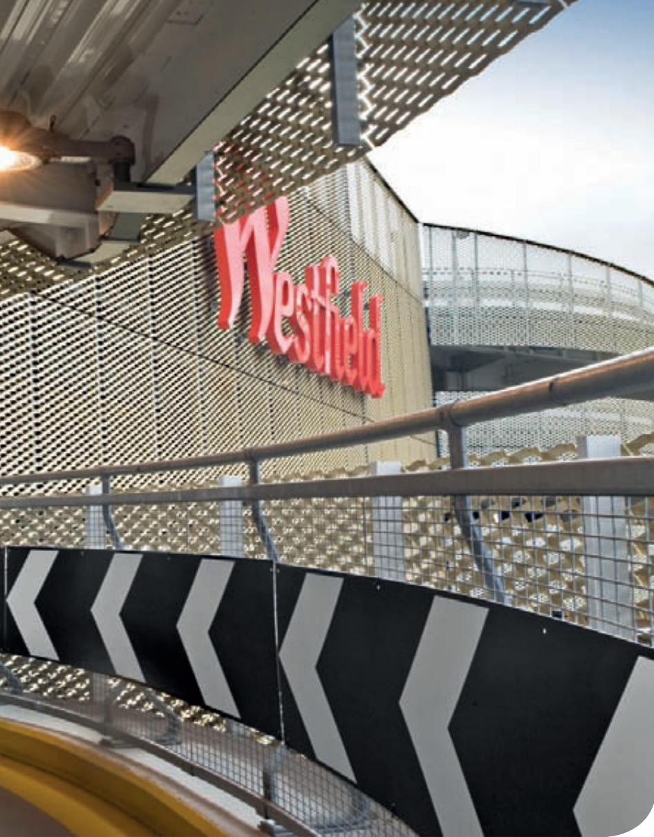
Main image: Ramp Barriers