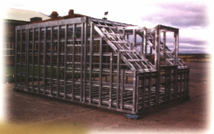
AyrFrame Module Prior to Fit-out