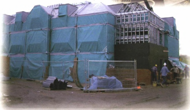
AyrFrame Modules on Site