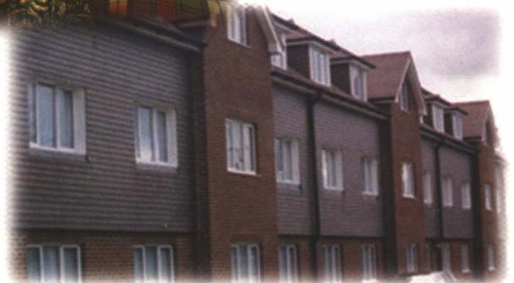
Another Satisfied Customer

“BUILD with CONFIDENCE, IT’S SIMPLY CHILD’S PLAY”