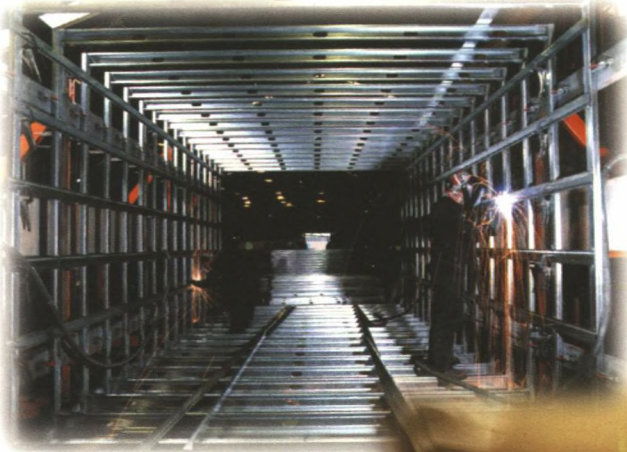
AyrFrame Module During Fabrication

Fast Track Modular Construction Solutions from AYRSHIRE STEEL FRAMING