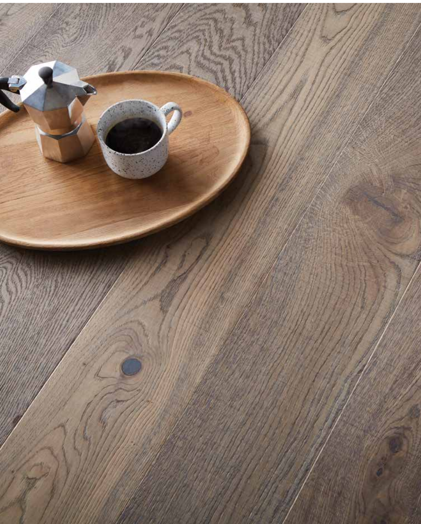
Above 900121 Camden Oak