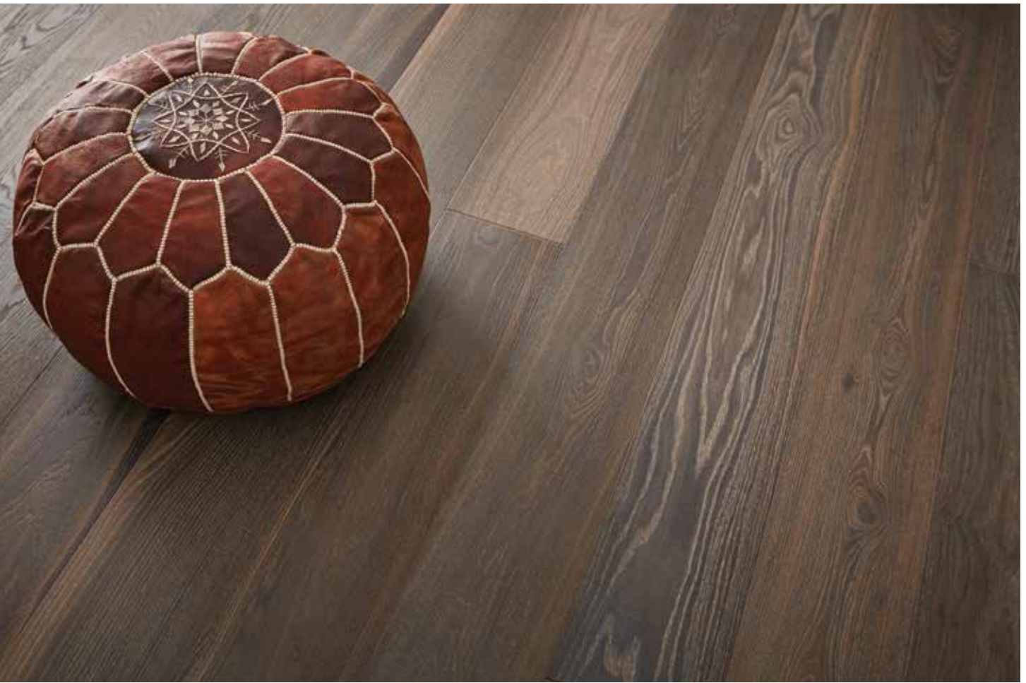
Above 900117 Sorano Smoked Oak