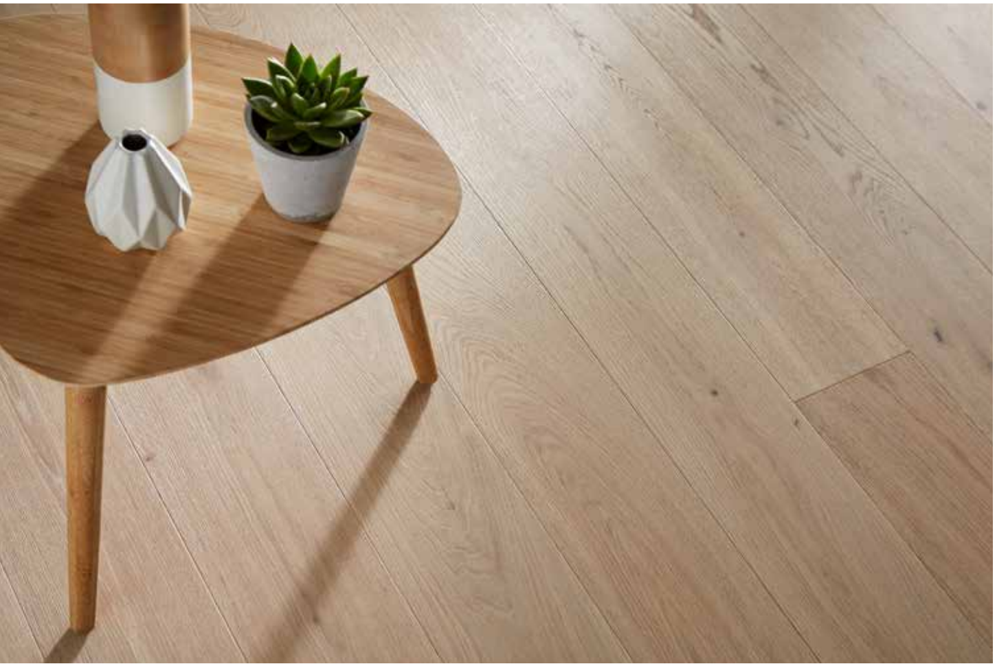
Above 900113 Avalon Oak