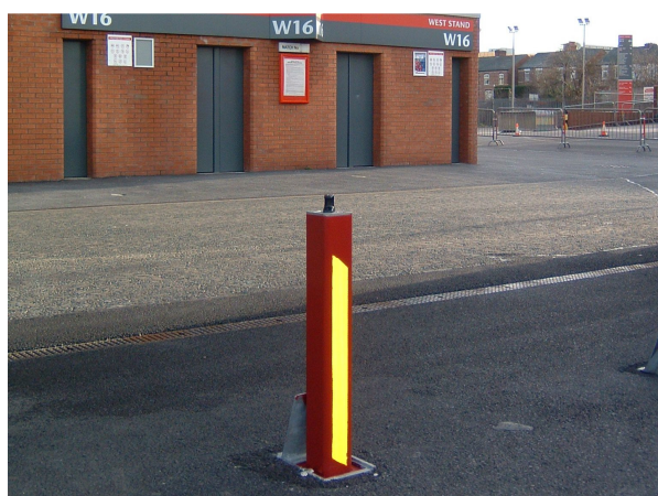
Manchester United Football Club