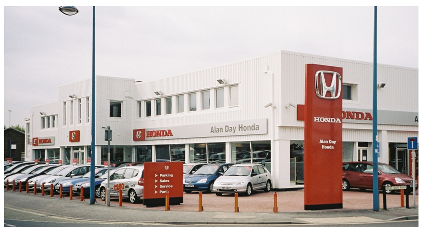
One of many car garages across the UK - Honda