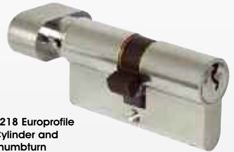
5218 Europrofile Cylinder and Thumbturn