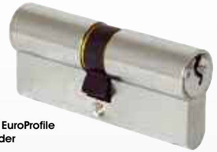
5214 EuroProfile Cylinder