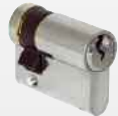
5222 Half Profile Cylinder