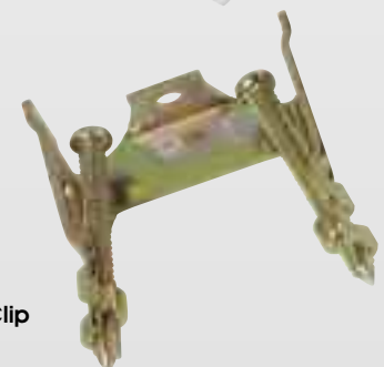
5211 Lock Mounting Clip