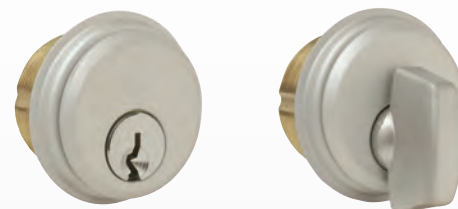
5228 Round Mortice Cylinder