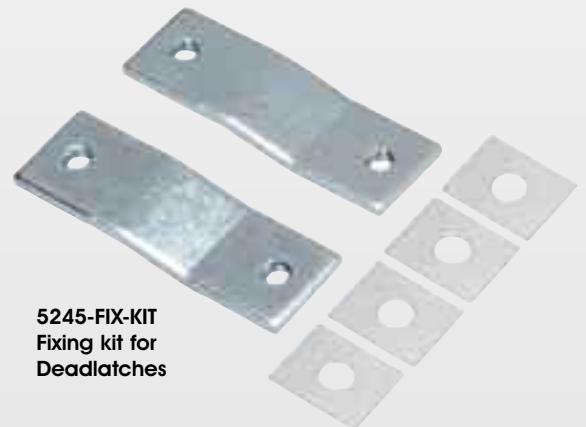
5245-FIX-KIT Fixing kit for Deadlatches