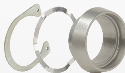
5231 Round Mortice Cylinder Guard