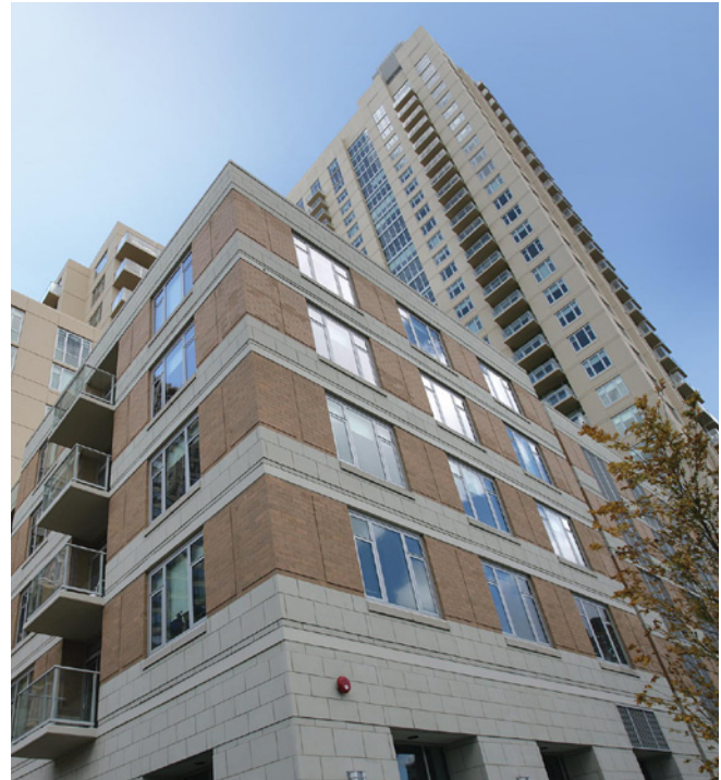
The Admiral at the Lake, Chicago, Illinois, USA Architect: Perkins + Will, Dallas, Texas, USA Window Installer: Softer Lite Window Company, Chicago, Illinois, USA TR-700 Window Wall with TR-710 – 4-5/8" Offset Casement Thermal Aluminum Windows (Outswing) TR-750 – 4-5/8" Offset Projected Thermal Aluminum Windows (Project Out) TR-780 – 4-5/8" Offset Depth Fixed Thermal Aluminum Windows

Kawneer Company, Inc. 555 Guthridge Court Norcross, GA 30092 770 . 449 . 5555 TEL