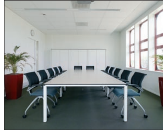
Project: ROC college for vocational education, Venray