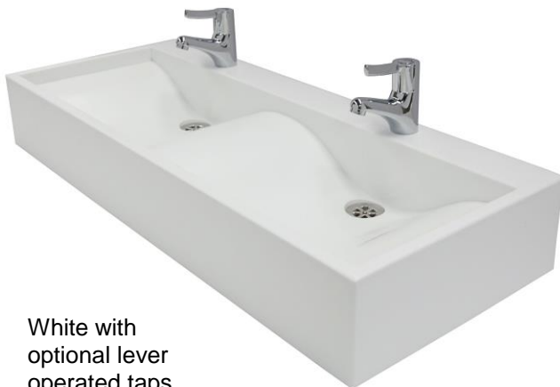
White with optional lever operated taps