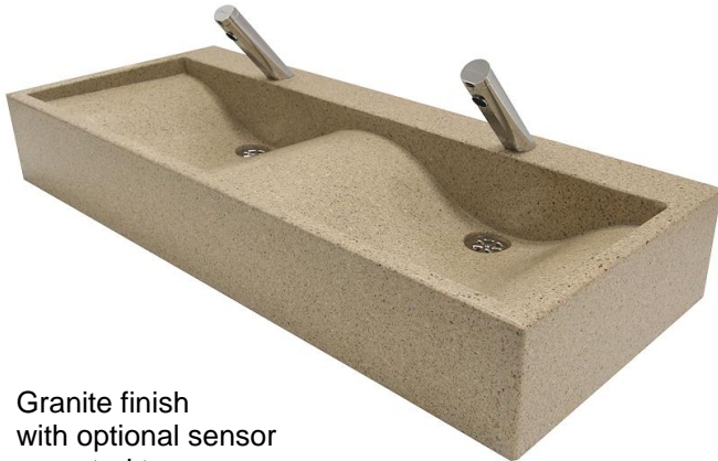
Granite finish with optional sensor operated taps