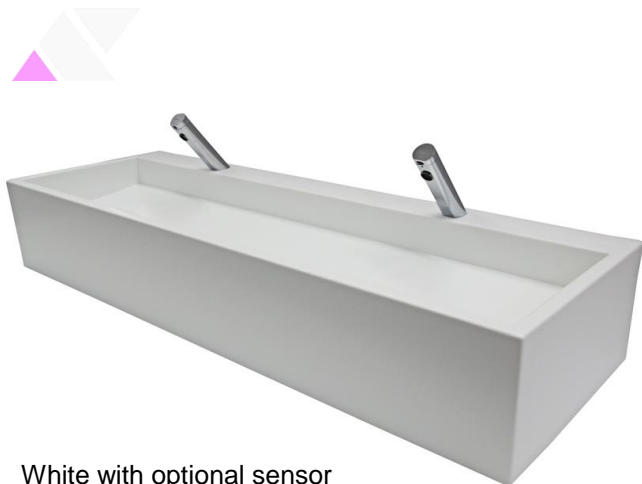
White with optional sensor operated spouts