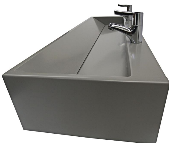
Grey with optional lever operated taps