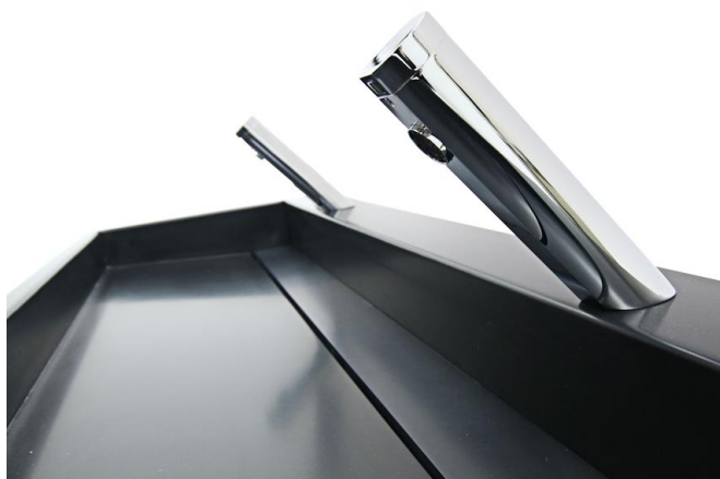
Black with optional sensor operated taps. Shown with gully cover in place.