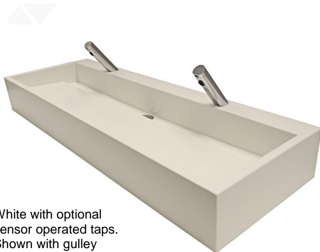
White with optional sensor operated taps. Shown with gully cover removed.