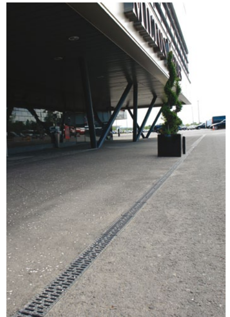
The visually sensitive main entrance to the stadium and its hospitality areas is complimented by ACO MultiDrain M100D.