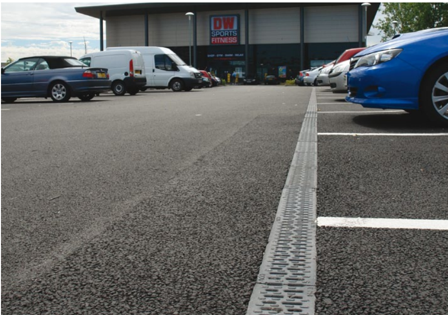
Runs of ACO ParkDrain have been installed across the busy customer car park at the fitness centre adjacent to the stadium.