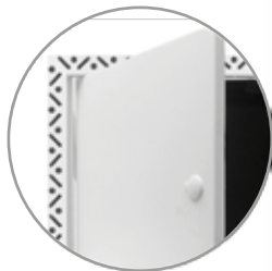
BFS BEADED FRAME