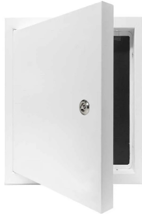
*SINGLE/TWIN TRI-DRIVE LOCKS