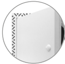
BFFD BEADED FRAME