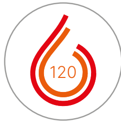
120 MINUTE FIRE RATED BOTH SIDES