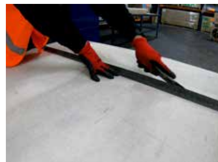
Score and snap method for cutting

on the desired radius of the curve. During installation on curves fine cracks may appear in the surface and core of the board. These will not adversely affect the performance of the system.