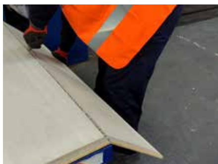
Score and snap method for cutting

For services and pipework a hole saw with a diameter 10mm larger than the penetration can be used. The gap around the services should then be sealed using Wraptite® Liquid Flashing or proprietary collar.