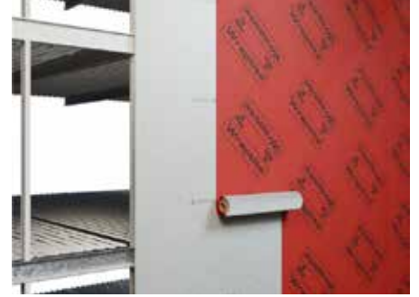
Wraptite vertically installed over Proctor A1 Sheathing Board