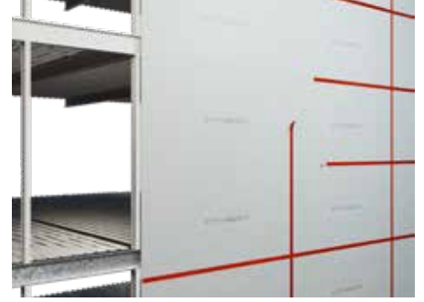
Wraptite Tape used to seal gaps between external sheathing boards.

Board should not be carried flat as risk of breaking. 2 man handling required.