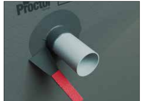
Service penetration through the boards, sealed with Wraptite LF