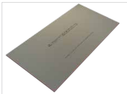
Proctor A1 Cement Board

Proctor A1 Cement Boards are formulated to be lightweight, easy to cut and quick to install.