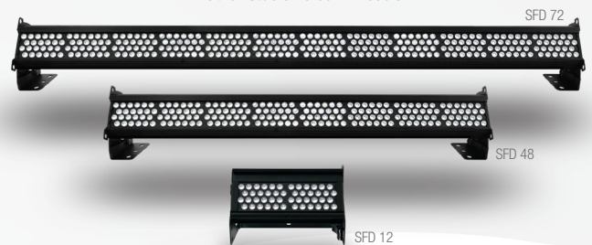
Other Studio Force D Models

Variable white and RGBA colour variants of each model are also available – see the Color Force range.